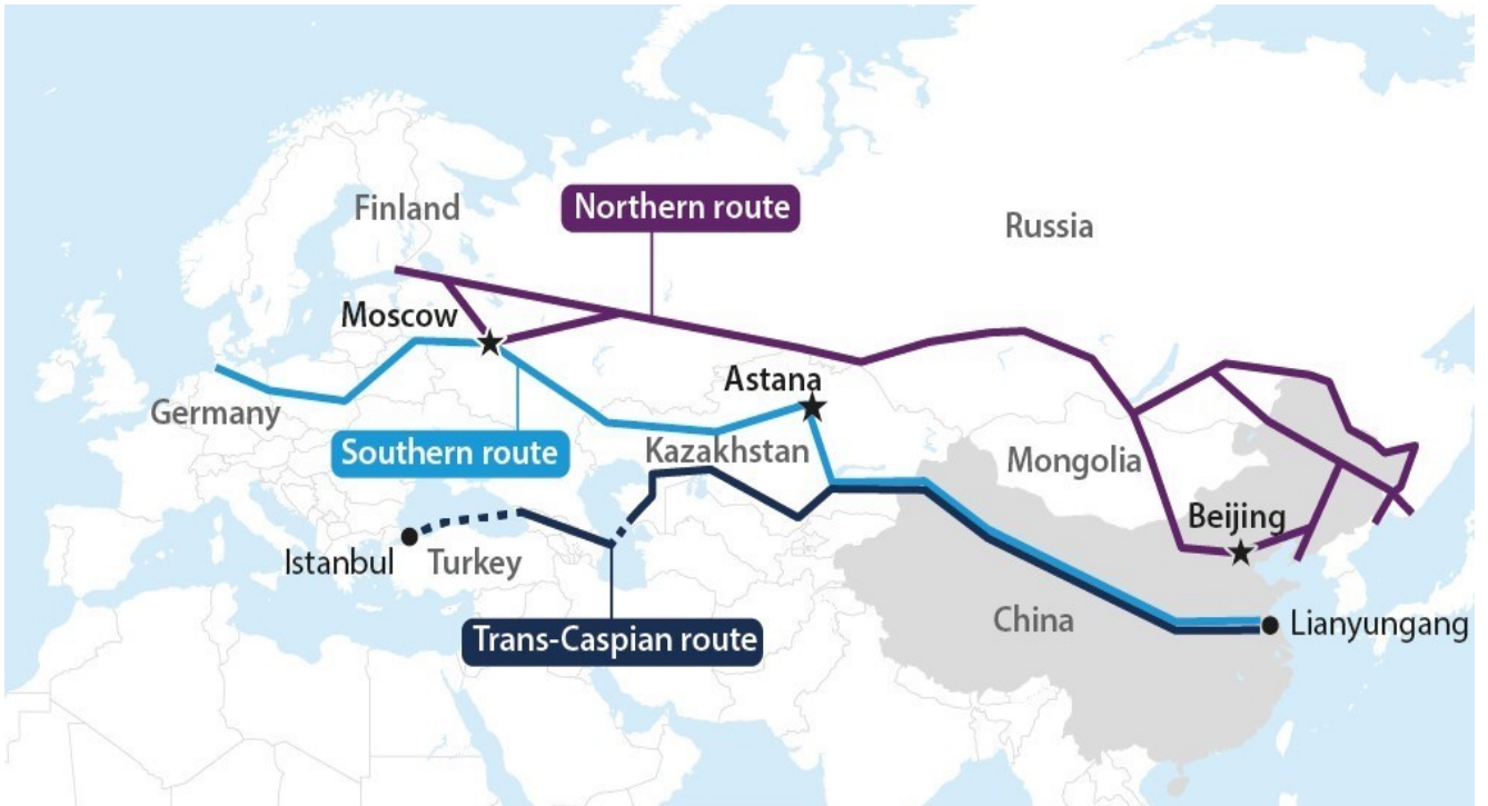
Figure 1. China: 'The Belt and Road' rail routes