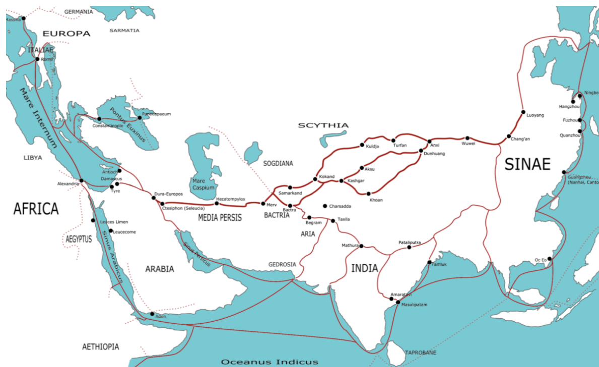
Figure 3. The trade routes of the Roman Empire