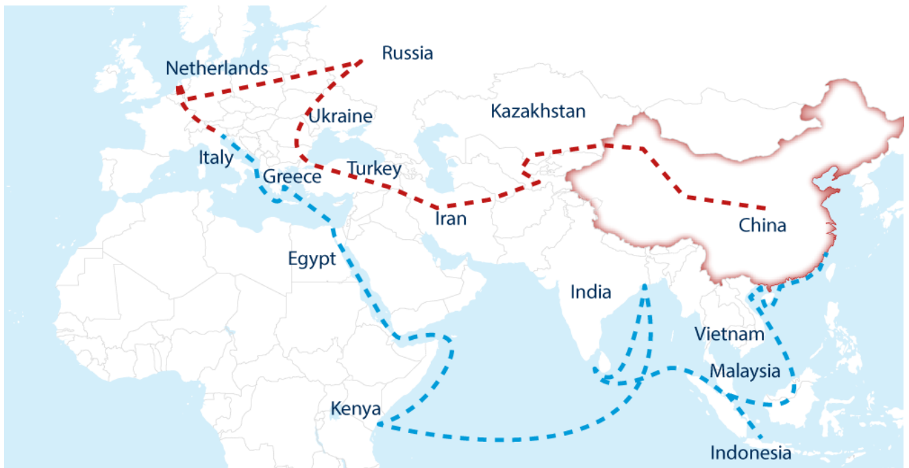
Figure 2. The land and maritime routes of 'the Belt and Road'